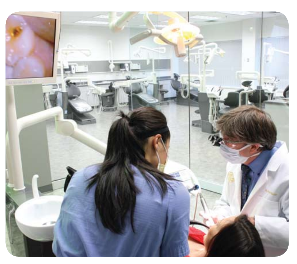
The renovation was possible through the generous support of the dental industry, the College, individual dentists and the BC Dental Association. The facility redevelopment is worth close to $2 million.

onstruction and re-equipping of the old study club facility at the College Place building in Vancouver are complete and the new lecture theatre and clinic are being utilized by study clubs again. The facility features 11 state-of-the-art operatories with Sirona equipment. The lecture theatre accommodates 28 participants, is set for widescreen presentation with the latest audiovisual capability and can webcast programs to dentists throughout B.C.